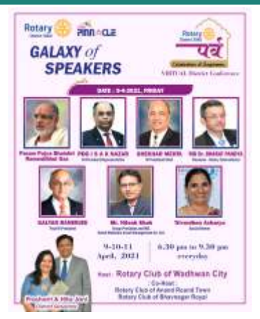
APRIL 9TH, 10TH &11TH OUR CLUB MEMBERS PARTICIPATED IN VIRTUAL DISTRICT CONFERENCE.